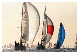
A close reach under spinnaker, with the leading race yachts backlit by the rising sun in 2010.