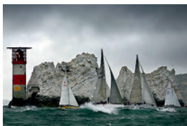
Crashing out past The Needles in steep, short seas in 2008. A Cork 1720 one-design leads Koko Koi. Note the inshore lifeboat crew, far right, at the ready.