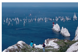
Walkers enjoy the spectacle of the fleet rounding a mark off The Needles on a perfect day in 1988. The large white boat on the far right is the J Class Velshedra.