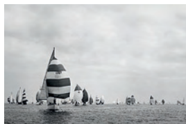
The little sloop Meon Maid II runs down the Western Solent under spinnaker in 1964 ahead of Excalibur of England.