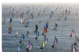
A pattern of colour spread over the sea as yachts fan out across the Solent, appearing to stretch to infinity.