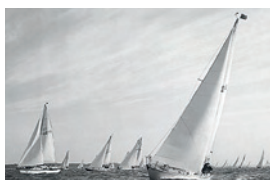
Glass-fibre designs starting to show their potential in 1966. A modern sloop hard on the wind in the Western Solent.