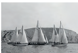
Holding the tide as they pass Alum Bay on the Isle of Wight, yacht Assegai II leads Aegle, Vanity, Quiver IV, and Breakaway in 1968.