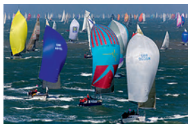
A strong tide running and a strong breeze sends yachts bowling down the Solent in 2008