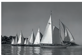
The schooner Seabill ghosts over the start line on a glorious calm summer's day in 1959.