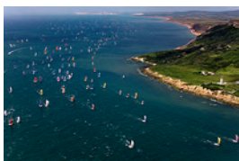
Yachts trace the shape of the southern coastline of the Isle of Wight in 2009. At the right of the foreground is the most southerly landmark of the race, St Catherine's lighthouse.