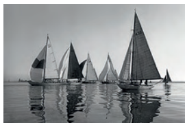
Faltering in light airs against a foul tide in 1958. Drumbeat, with her striped spinnaker, leads from a clutch of yachts on the way back to the finish.