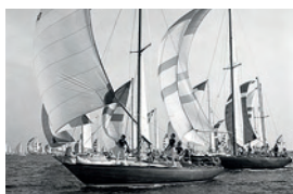
Sir Max Aitken's smartly dressed crew on his successful Sparkman & Stephens designed IOR racer Roundabout in 1971. The boat had won the Gold Roman Bowl five years earlier.