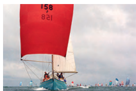
One of the first colour photographs ever taken of the race in 1969, showing the Royal Air Force Association's yacht Slipstream of Cowley with a colourful pack of chasing yachts astern.