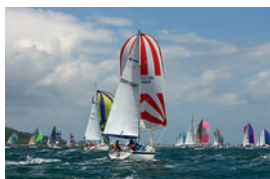
Cruising yachts at full pelt under spinnaker round the south of the island in 2009. In the foreground is Evening Storm from Poole.