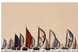
A beautifully composed image of yachts emerging from an early morning haze in 2010.