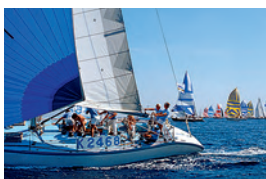
Former Prime Minister Edward Heath standing next to the helmsman on his yacht Morning Cloud IV on the way to winning the Gold Roman Bowl for the fourth time in 1980.