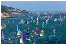
A vivid sight as a procession of yachts enjoy a fast downwind leg under spinnaker past Shanklin in 2009.