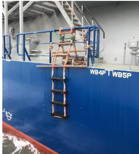
Example of a non-compliant Pilot Boarding Arrangement

Further information regarding the importance of safe Pilot Boarding Arrangements can be found at www.ics-shipping.org