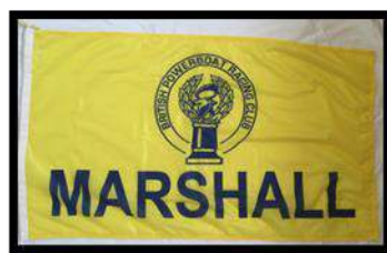
Fig 2: BPRC Marshall Flag

This procedure will then be repeated for the Cowes – Poole – Cowes Race, with race start at 0915. The pre-start corridor off Cowes will be marshalled by 10 boats flying a BPRC Marshal flag (see Fig 2) with the Cowes Harbour Master Launch stationed in the Outer Fairway monitoring VHF Channel 69.